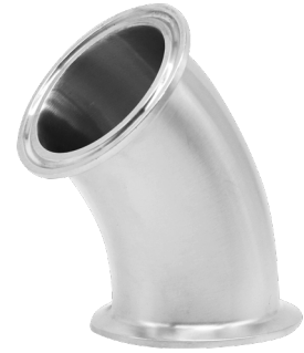
Unit: mm (unless stated otherwise)