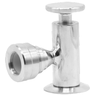
Unit: mm (unless stated otherwise)