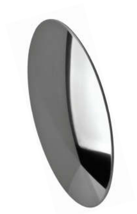
Unit: mm (unless stated otherwise)