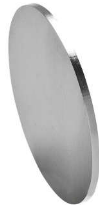
Unit: mm (unless stated otherwise)