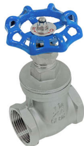
Unit: mm (unless stated otherwise)