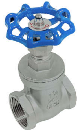
Unit: mm (unless stated otherwise)