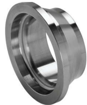
Unit: mm (unless stated otherwise)