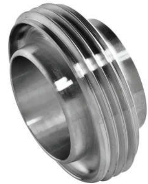
Unit: mm (unless stated otherwise)