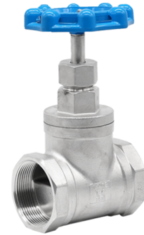
Unit: mm (unless stated otherwise)