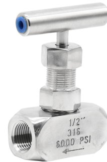
Unit: mm (unless stated otherwise)