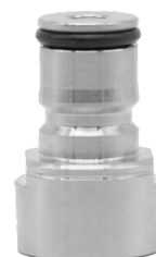
Unit: mm (unless stated otherwise)